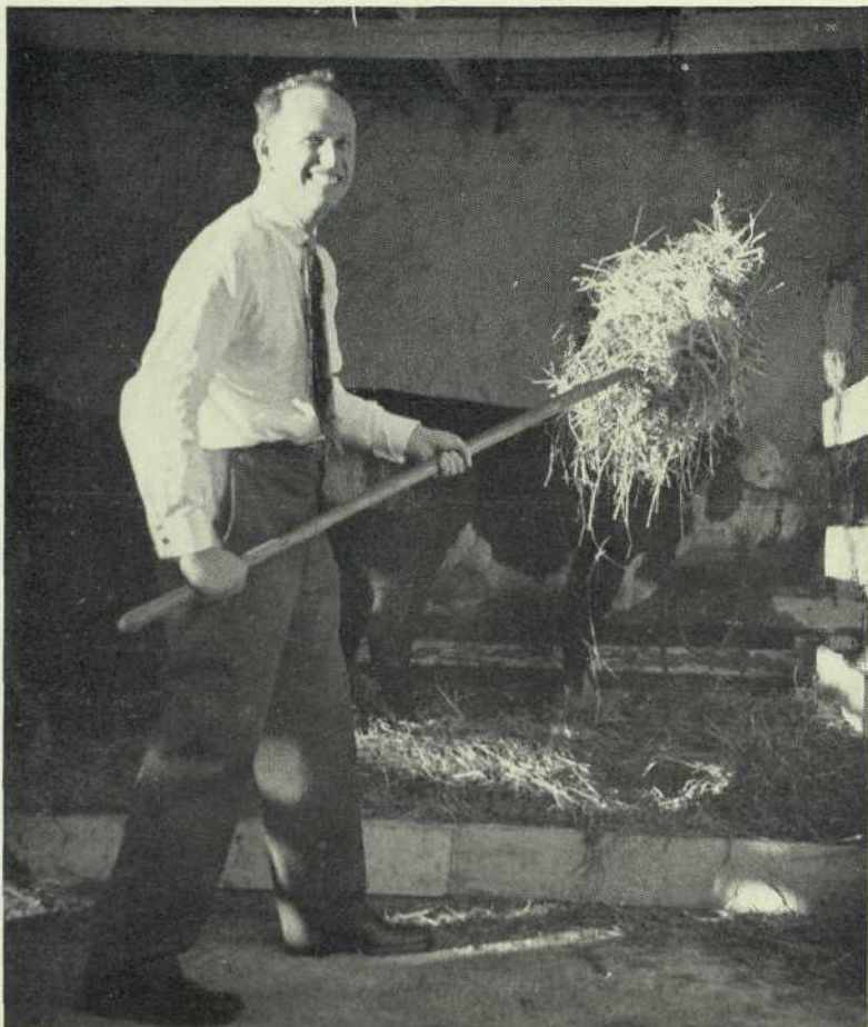
HAY! DO OUR ARGUS EYES DECEIVE US?

All employees must notify the Personnel Department of any change of address. This information is necessary to insure contact with employees in regard to work in their department as well as with relatives in case of emergency.