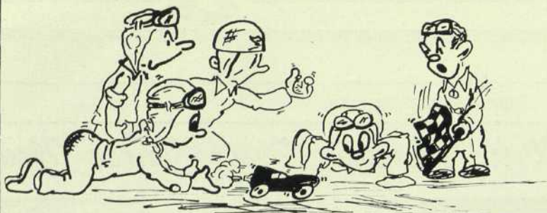
"Argus Jet Research!"

The latest noon-time recreation in the Engineering Department these days, is jet racing. Bob White , Bob Borusch and Verne Nelson built small racers propelled by carbon dioxide cartridges. The cartridges, in the rear of the racer, are punctured to release the gas which acts as a rocket engine. Verne Nelson's racer holds the record with an average speed of 80 m.p.h. for the length of the 150 foot corridor.