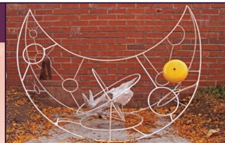
Little Dog Laughed by Jim Pallas, now on display in the Downtown Library garden.

The Washtenaw Alliance for Virtual Education (WAVE) is an alternative public high school program for Washtenaw County students. WAVE meets at AADL several times a week.