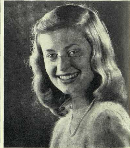
Our Gal Sal