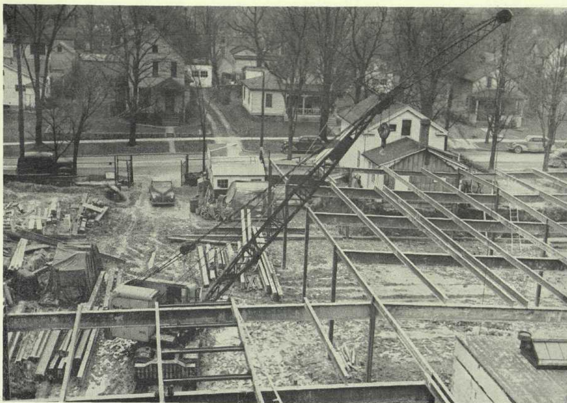
STEEL GIRDERS GOING UP, ANOTHER STEP IN THE GROWTH OF ARGUS