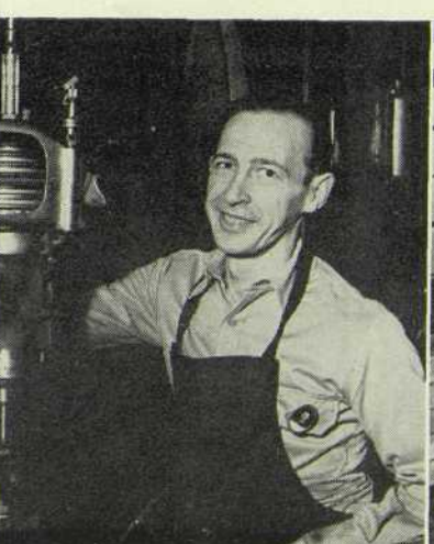
LESTER BAILEY Machine Shop