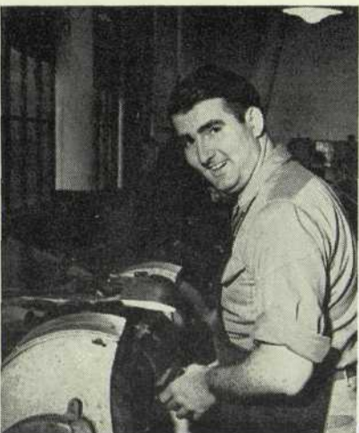
DON STRITE Machine Shop