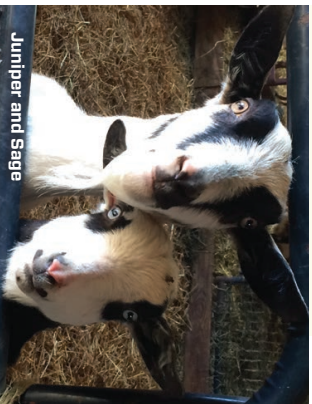
Juniper and Sage