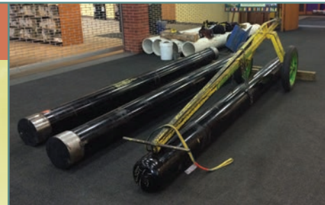
New elevator jack waiting to be installed, Summer 2014 Downtown Library

Contact your AADL Library Board at board@aadl.org