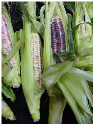
Ancient varieties of maize.

and smoked meat. These two could be kept for a long period of time. Cornmeal was used to make sagamité , a kind of porridge to which could be added either smoked meat, fish, or another kind of meat, preferably fatty. Sagamité was the staple of the voyageurs' foodways; it had been borrowed from natives among whom it also played a central role, from the Illinois Confederation in the Middle Mississippi to the Huron and Iroquois nations in the St. Lawrence. Depending on local availability, berries (mentioned by both Marquette and Perrot) and nuts supplemented the roster of foodstuffs. 5