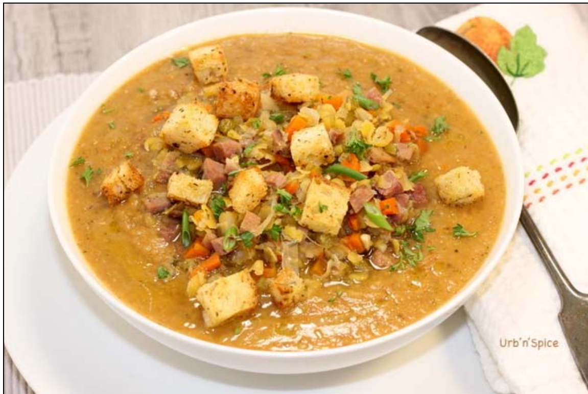
Denise's photo of her soup in the relatively rustic version topped with croutons.