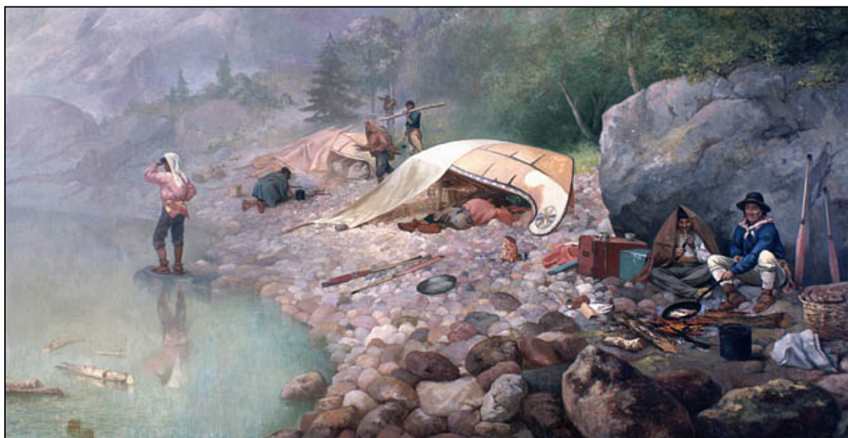
"Voyageurs at Dawn" is an 1871 work by Frances Anne Hopkins, a painter whose husband was a Hudson's Bay Company official.