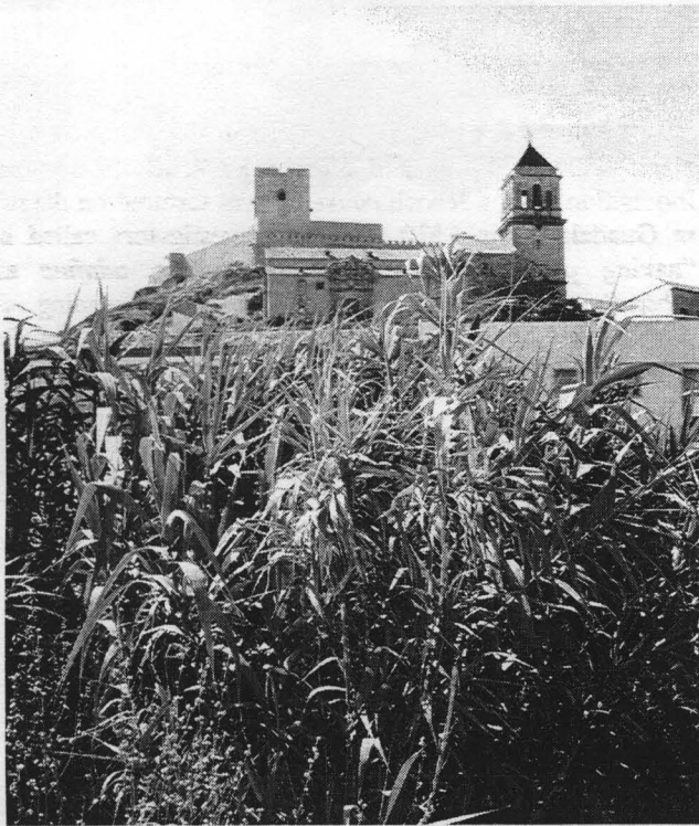
A small patch of sugarcane in Jaén province, southern Spain. At left in the distance are the remains of the 10 th -Century Moorish castle of al-Qabdo'áq, modern Alcaudete.

cane were being sold at a sidewalk fruit stall in Granada, deep green in color, about 9 inches long and 3 inches wide.