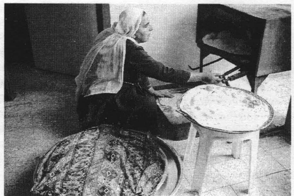
A woman prepares flat bread in a Druze village in Israel.

The highlight of our gustatory adventures was a Yemeni dinner at Maganda, a restaurant in Tel Aviv, on our last evening in Israel. Appetizers were served at three different times during the meal, and one had to be restrained in order to leave room for the main course. There was the usual hummus (with much less garlic than the American variety), tabbouleh (the salad of minced parsley, burghul and tomatoes), baba ghannoush (mashed roasted eggplant dip), grilled eggplant with tomatoes, zucchini with eggs and onions, olives, pickles, and more. Other rounds included Moroccan "cigars," phyllo dough wrapped around minced beef, and a spicy chopped tomato dish called matbuha , my favorite, which almost cried out for yogurt to cool it. Stuffed onions and zucchini filled with meat and rice were served. Many dishes are seasoned with tahineh (sesame paste) and cilantro. The main course at Maganda included excellent lamb and chicken on long metal skewers. The traditional baklava and Turkish coffee followed. ■